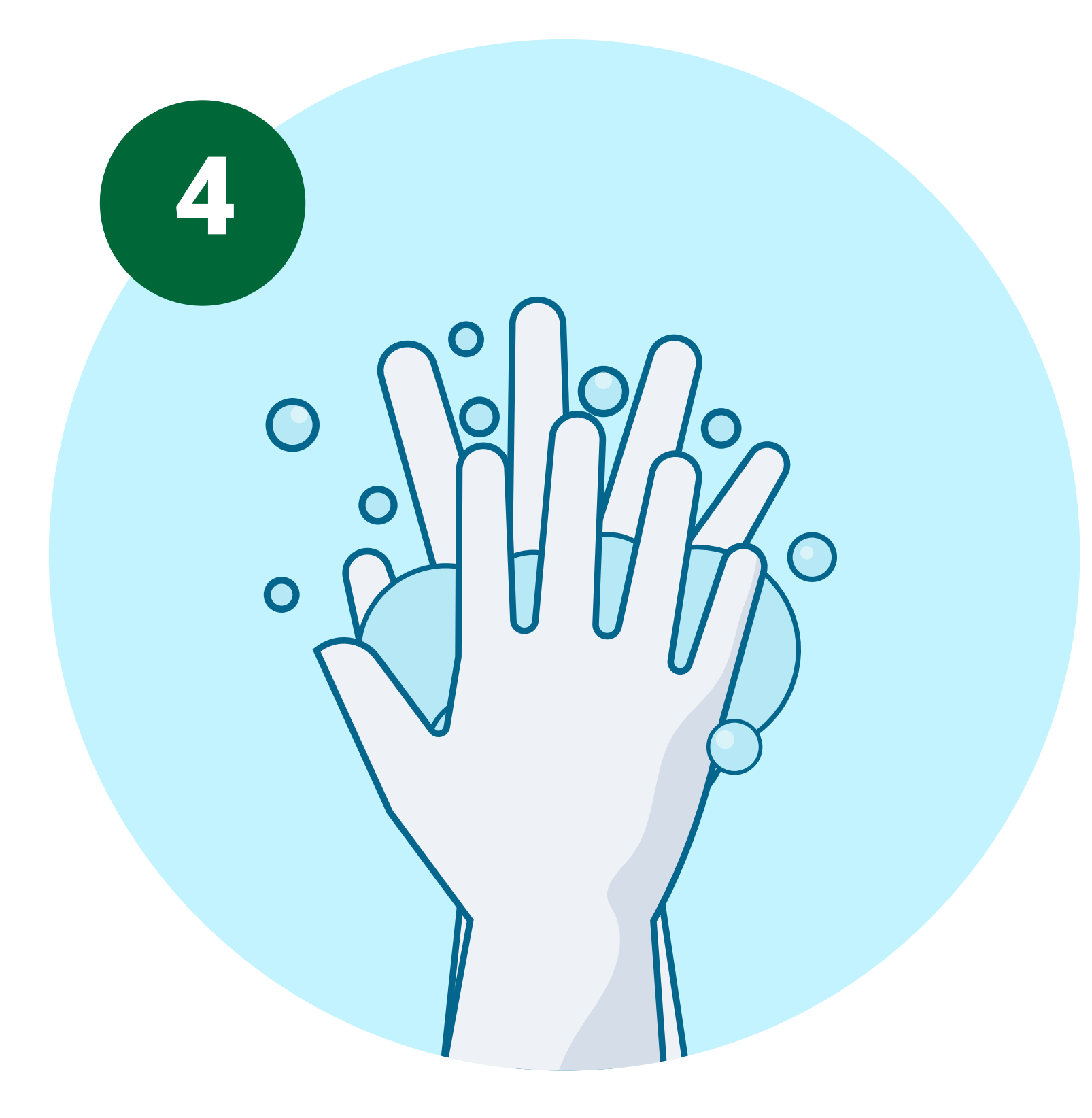
Palm to palm with fingers interlaced