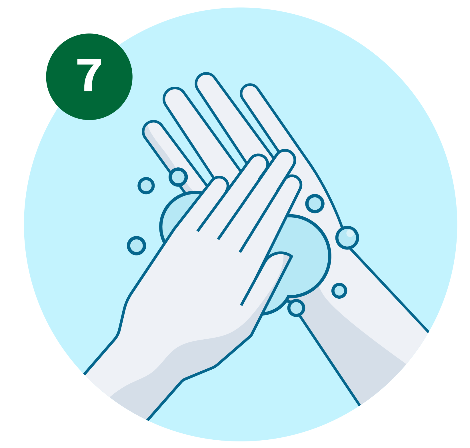
Wash hands for 20 seconds