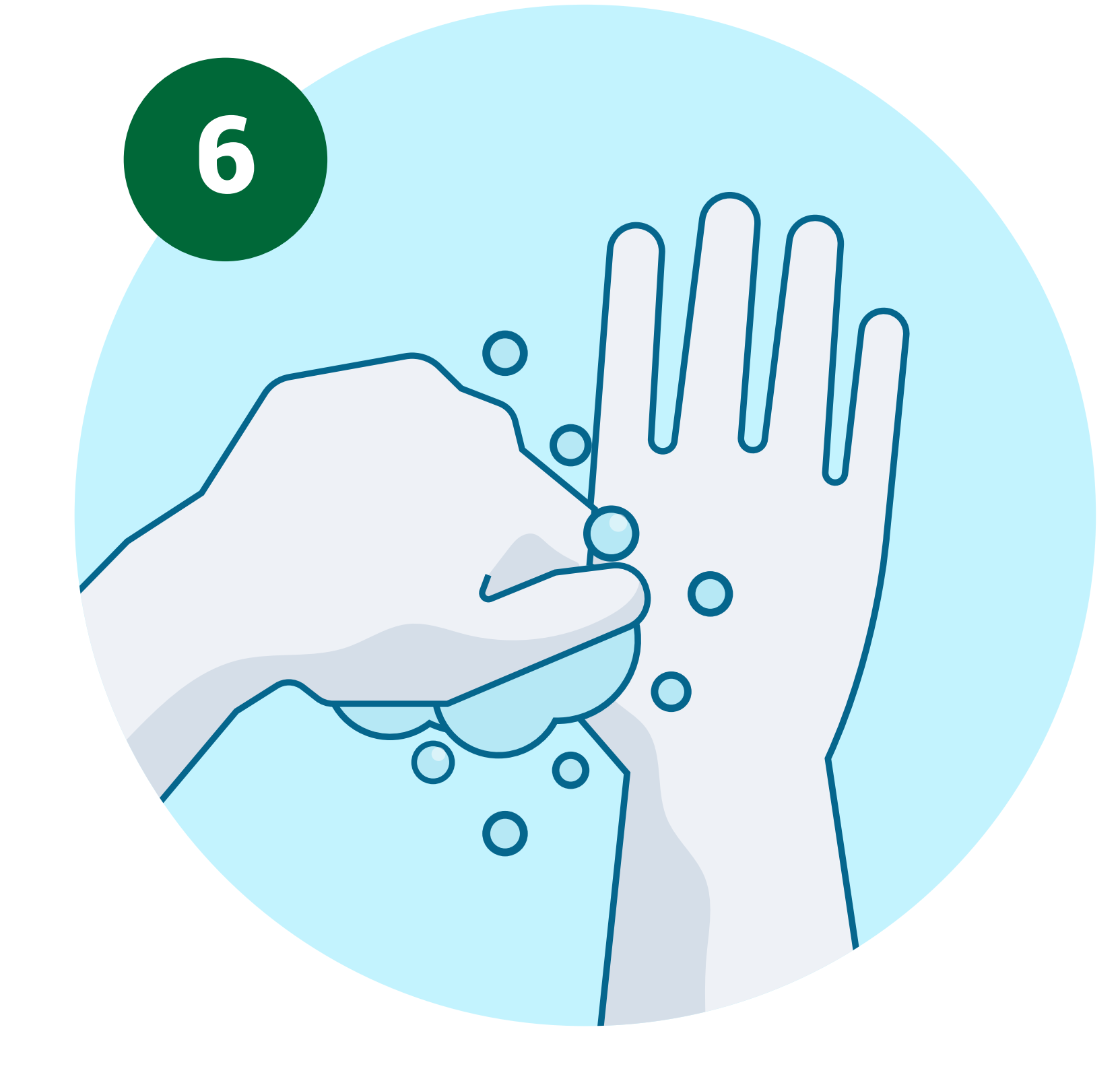
Base of thumbs and fingernails