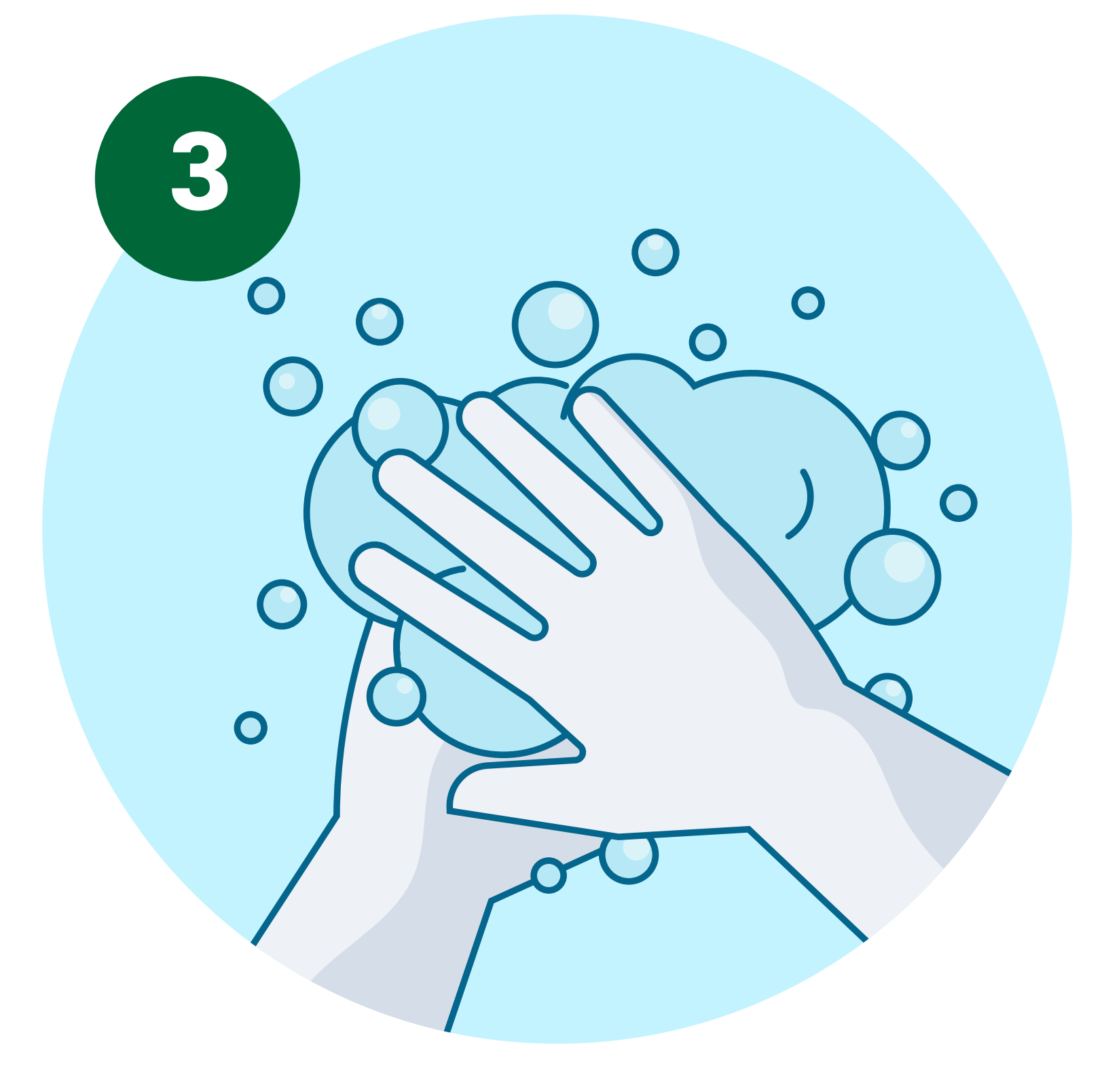
Scrub palm to palm