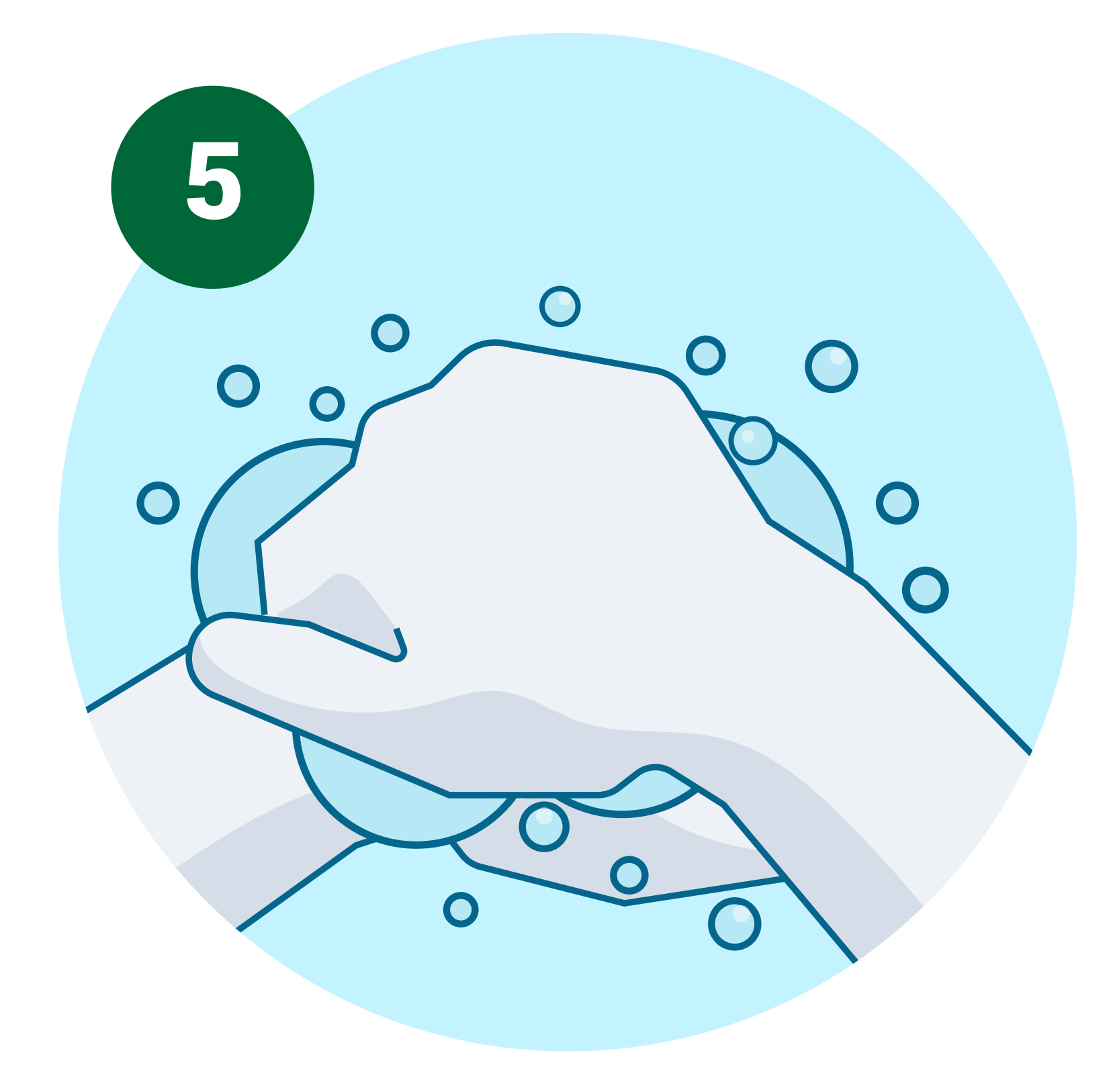
Scrub back of hand