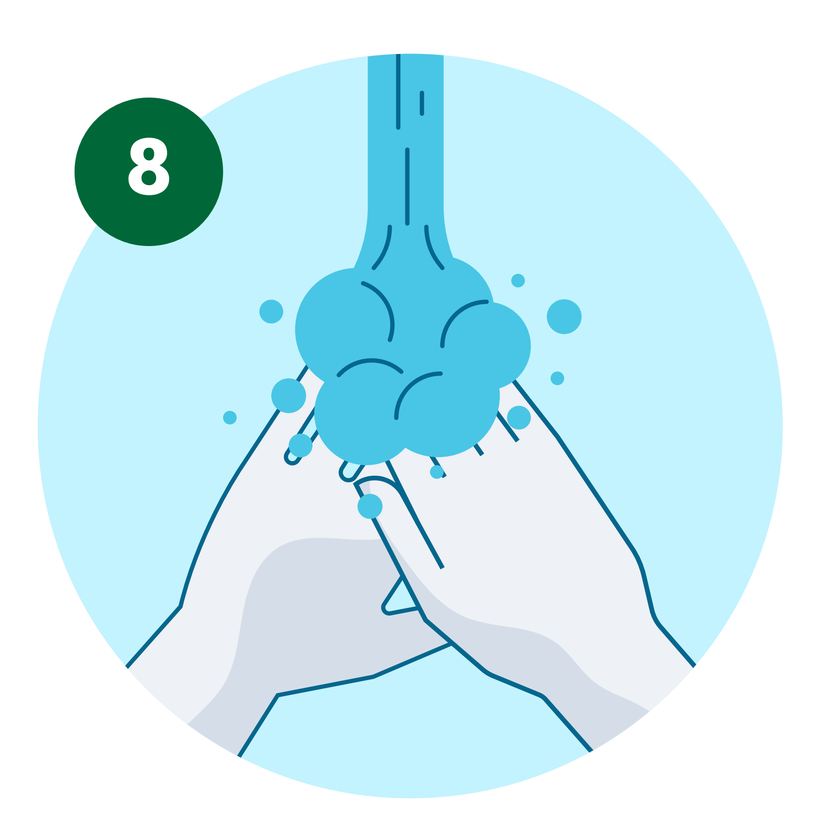
Rinse hands with water