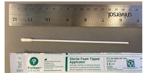
3 Foam tipped oral-nasal swab