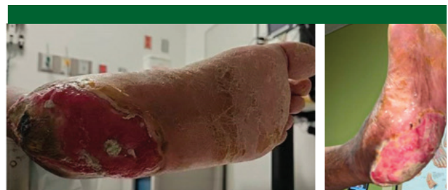
Figure 3: Interval images showing marked improvement with granulating tissue present throughout majority of the wound.