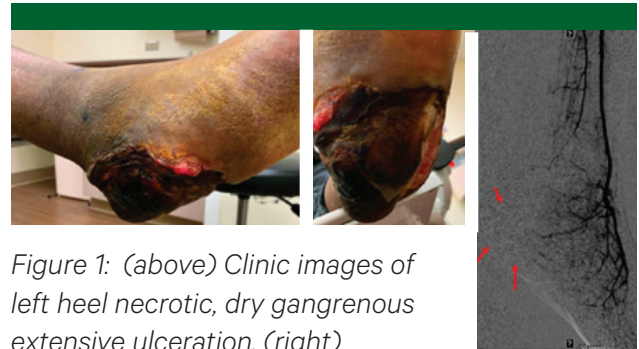
Figure 1: (above) Clinic images of left heel necrotic, dry gangrenous extensive ulceration. (right) Angiogram of left foot before DNA showing lack of adequate perfusion to the heel region (red arrow)

After this, careful navigation of the venous outflow channels in the ankle and foot had to be navigated, to find the best outflow vein to return the blood back up the leg. After coil embolization of a competing collateral vein, the procedure was completed. A completion angiogram showed intact blood flow from the proximal tibial artery down the posterior tibial vein and towards the midfoot.