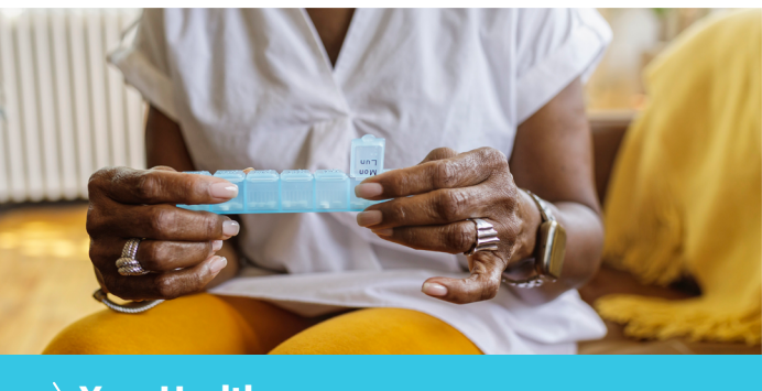
ightarrow Your Health